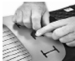
3. Snap into place in slot