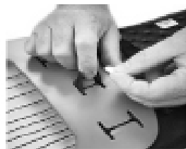
2. Place standard rivet head in slot