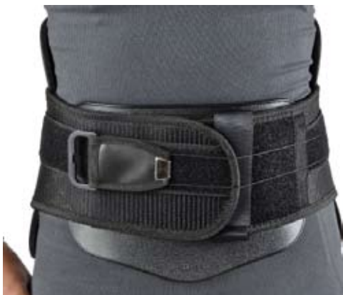
Anterior panel provides additional support.