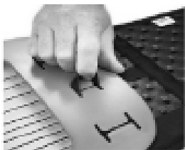
1. Lift up attachment strap