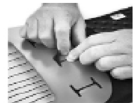
4. Slide rivet head to end of slot to remove