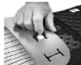
Placed rivet head