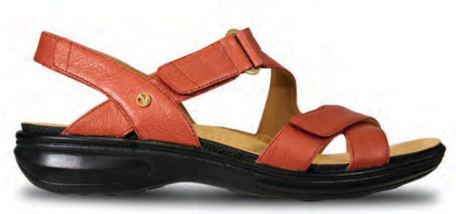
NEW Ruby Metallic (Medium Width Only)