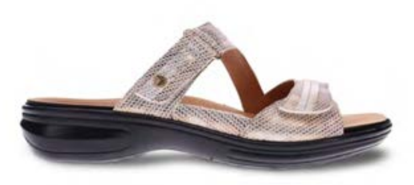
Metallic Interest (Medium only)