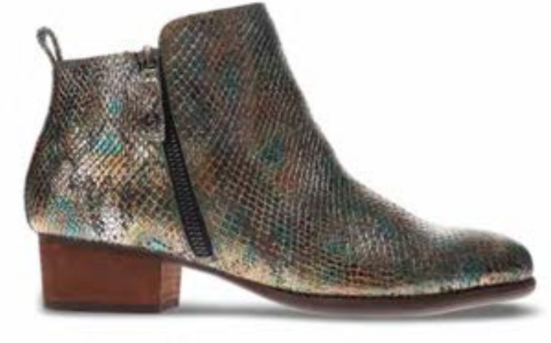
NEW Peacock Python