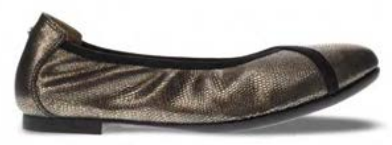
NEW Golden Sheen

MSRP: $129.95 WHOLESALE: $57.50 Medium ONLY WIDTH: Full Sizes 5 to 12 US SIZES: