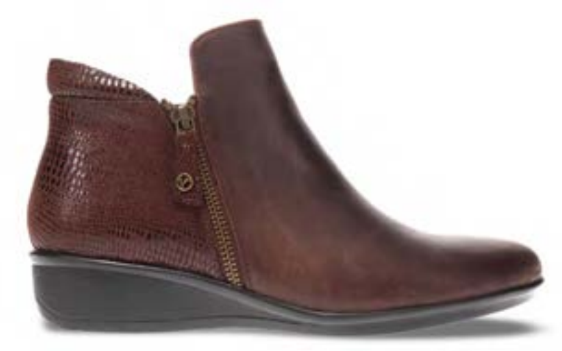
NEW Espresso /Espresso Lizard