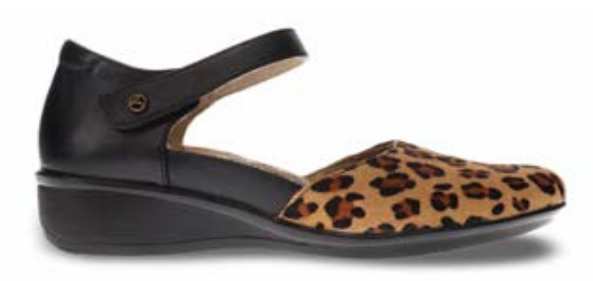
NEW Leopard/Black French