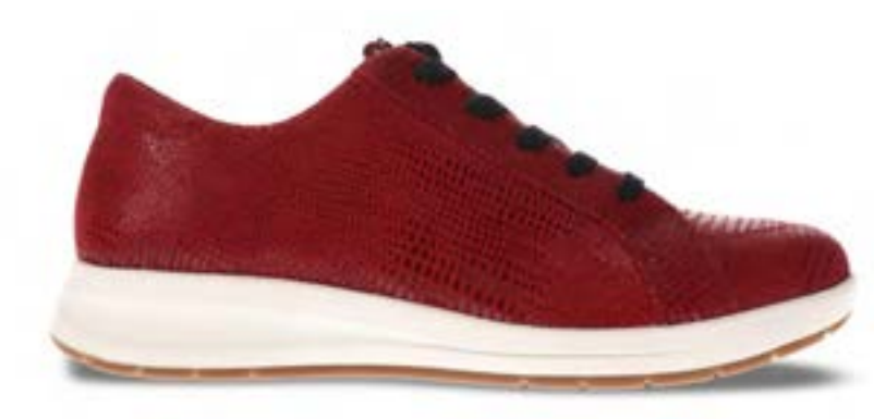
NEW Cherry Lizard