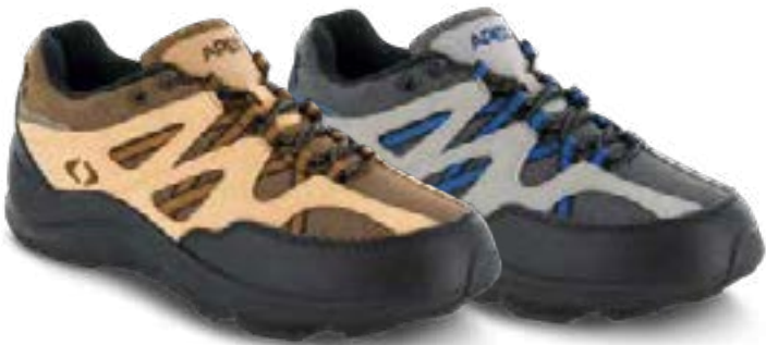
V751M Color: Brown Sizes: 6.5-13, 14, 15 Widths: M, W, XW Depth: 5/16"