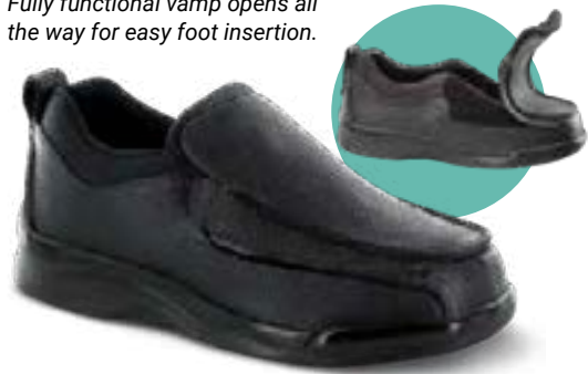
B5000M Color: Black Sizes: 6.5-13, 14, 15, 16 Widths: W, XW, XXW Depth: 1/2”

Fully functional vamp opens all the way for easy foot insertion.