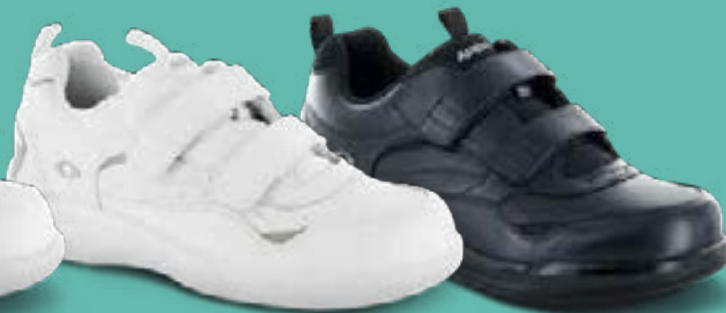
G8210M Color: White Sizes: 6.5-13, 14, 15, 16 Widths: M, W, XW, XXW Depth: 1/2"