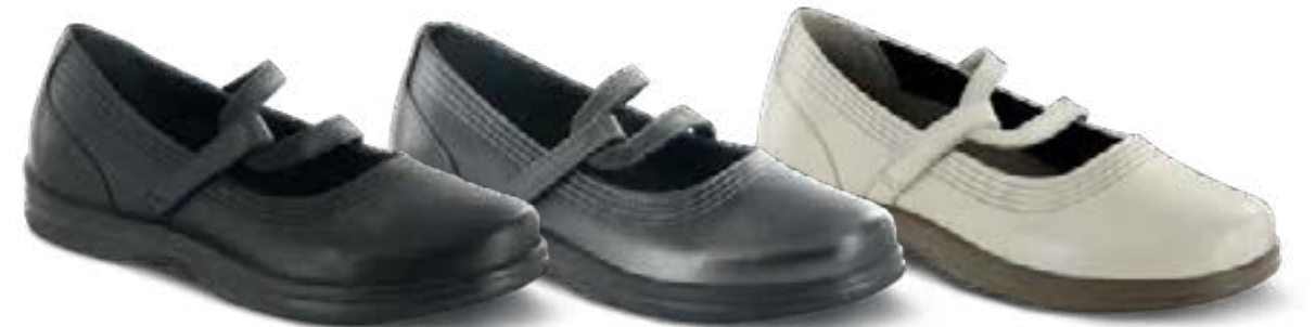
A300W Color: Black Sizes: 5-11, 12, 13 Widths: M, W, XW Depth: 5/16"