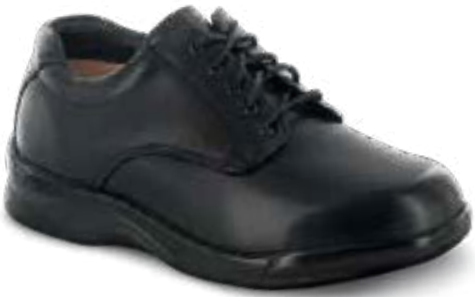
1270M Color: Black Sizes: 6.5-13, 14, 15, 16 Widths: M, W, XW Depth: 1/2”