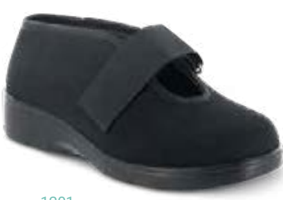
1201 Color: Black Med: 3.5/4-11.5/12 Wide: 4.5/5-14.5/15 Depth: 1/2” *Not PDAC Verified