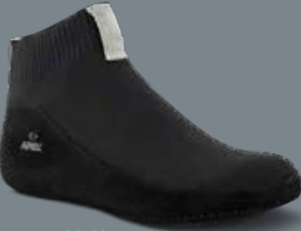
SS100 Color: Black Sizes: F: 5-15 M: 4-14 Widths: Stretchable Width Depth: 5/16" in 2 layers *Not PDAC Verified