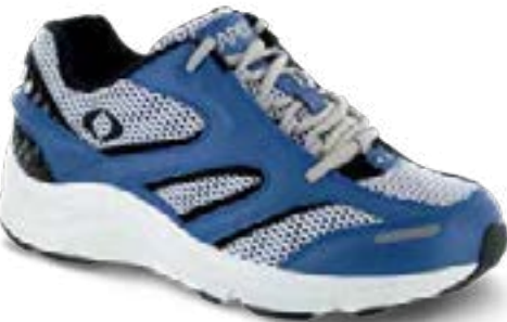
V551M Color: Blue Sizes: 6.5-13, 14, 15 Widths: M, W, XW Depth: 5/16"