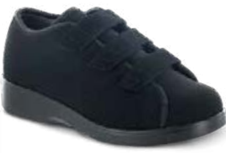
1209 Color: Black Wide: 4.5/5-12.5/13 X-Wide: 5.5/6-13.5/14 XX-Wide: 5.5/6-14.5/15 Depth: 1/2" *Not PDAC Verified