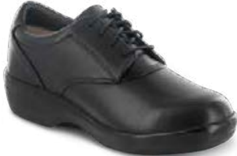
1270W Color: Black Sizes: 4.5-11, 12, 13 Widths: M, W, XW Depth: 1/2"