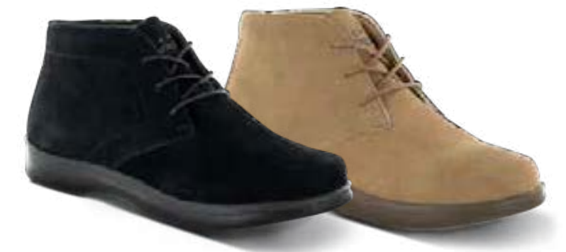
A500W Color: Black Sizes: 5-11, 12, 13 Widths: M, W, XW Depth: 5/16"