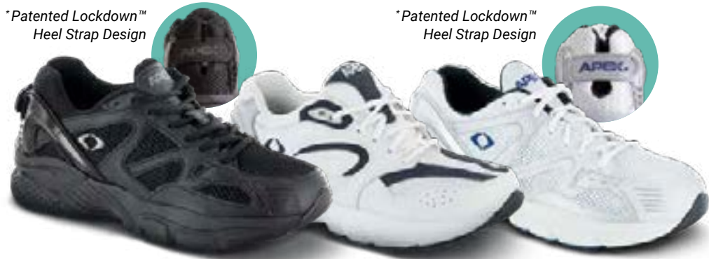
X520M* Color: Black Sizes: 6.5-13, 14, 15 Widths: M, W, XW Depth: 5/16"