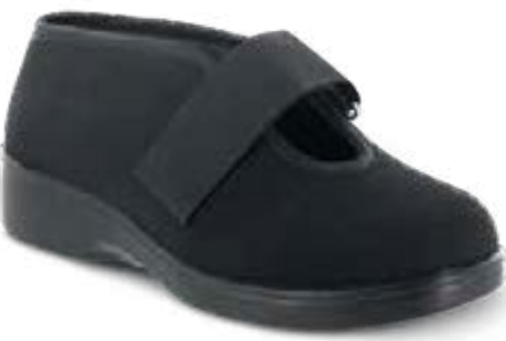
1201 Color: Black Wide: 4.5/5-12.5, 13 X-Wide: 5.5/6-13.5, 14 Depth: 1/2" *Not PDAC Verified