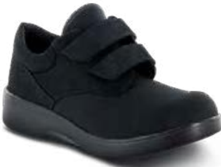
1200 Color: Black Wide: 4.5/5-11, 12, 13 X-Wide: 6-14 XX-Wide: 5.5/6-14.5/15 Depth: 1/2"