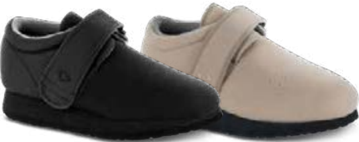
T2000 Color: Black Med: 3.5-11, 12 Wide: 5-13, 14, 15, 16 X-Wide: 6-13, 14, 15, 16 XX-Wide: 6-13, 14, 15, 16 Depth: 1/2”