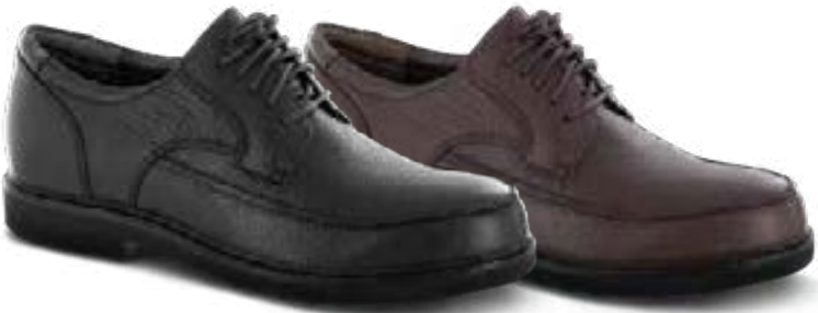
LT900M Color: Black Sizes: 7-13, 14 Widths: M, W, XW Depth: 1/4"