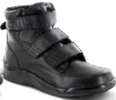
B4200M Color: Black Sizes: 6.5-13, 14, 15, 16 Widths: M, W, XW Depth: 1/2"