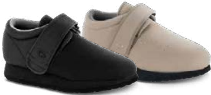
T2000 Color: Black Wide: 4.5-12, 13 X-Wide: 6-14, 15, 16 XX-Wide: 7-14, 15, 16 XXX-Wide: 7-14, 15, 16 Depth: 1/2"