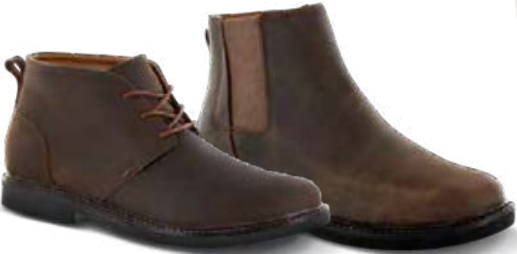
LT410M Color: Brown Sizes: 7-13, 14 Widths: M, W, XW Depth: 1/4"