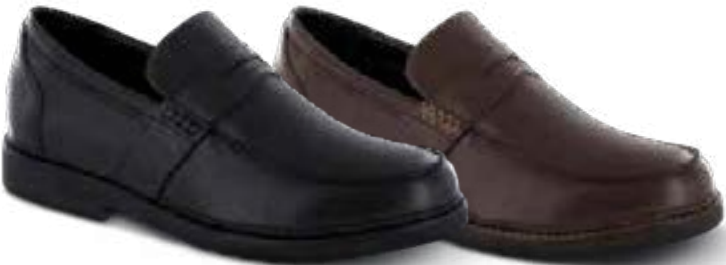
LT200M Color: Black Sizes: 7-13, 14 Widths: M, W, XW Depth: 1/4"