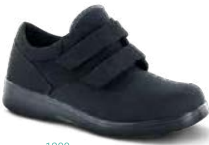
1200 Color: Black Med: 3.5-11, 12 Wide: 5-13, 14, 15, 16 X-Wide: 6-13, 14, 15, 16 Depth: 1/2”