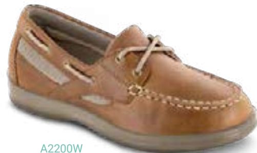
A2200W Color: Camel Sizes: 5-11, 12, 13 Widths: M, W, XW Depth: 5/16"