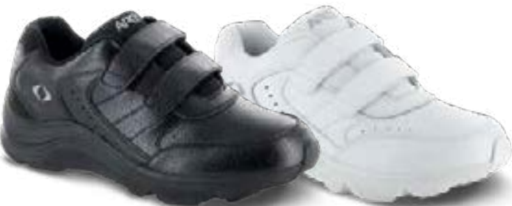
V950M Color: Black Sizes: 6.5-13, 14, 15 Widths: M, W, XW Depth: 5/16"