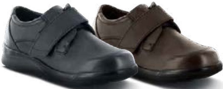
B3000M Color: Black Sizes: 6.5-13, 14, 15, 16 Widths: M, W, XW, XXW Depth: 1/2”