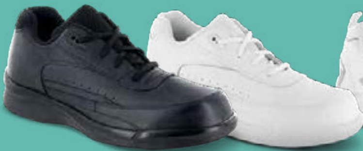
G7000M Color: Black Sizes: 6.5-13, 14, 15, 16 Widths: M, W, XW Depth: 1/2"