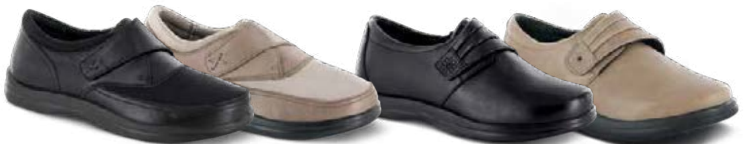
A720W Color: Black Sizes: 5-11, 12, 13 Widths: M, W, XW Depth: 5/16"