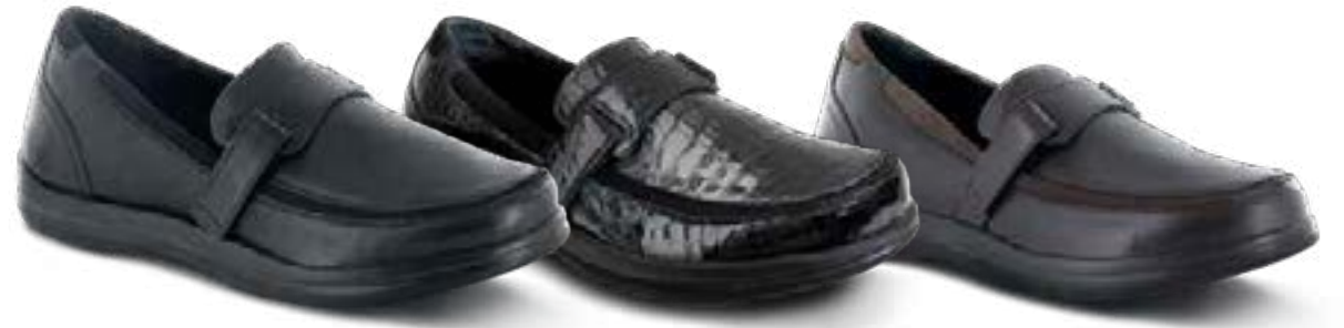
A200W Color: Black Sizes: 5-11, 12, 13 Widths: M, W, XW Depth: 5/16"