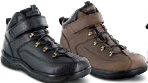
A4000M Color: Black Sizes: 7-13, 14, 15 Widths: M, W, XW Depth: 5/16"