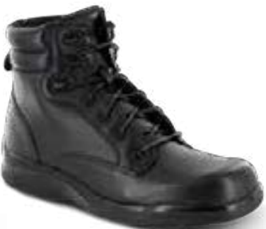
B4500M Color: Black Sizes: 6.5-13, 14, 15, 16 Widths: M, W, XW Depth: 1/2"