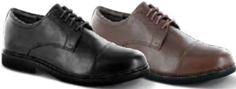
LT600M Color: Black Sizes: 7-13, 14 Widths: M, W, XW Depth: 1/4"