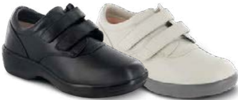
1260W Color: Black Sizes: 4.5-11, 12, 13 Widths: M, W, XW Depth: 1/2"