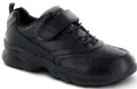
A6000M Color: Black Sizes: 7-13, 14, 15 Widths: M, W, XW Depth: 5/16"