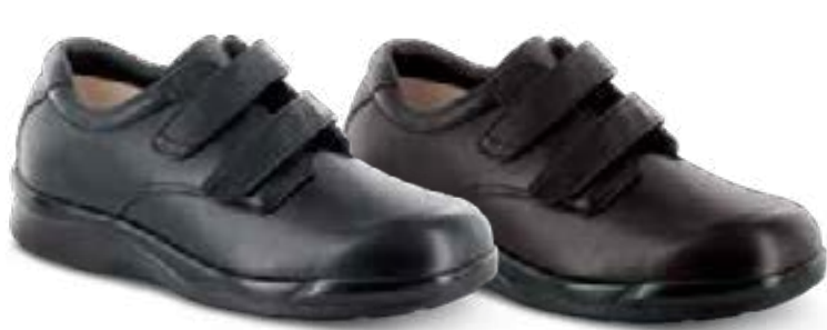
1260M Color: Black Sizes: 6.5-13, 14, 15, 16 Widths: M, W, XW, XXW Depth: 1/2”