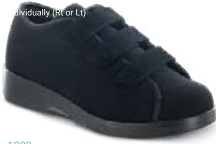
1209 Color: Black Med: 3.5/4-11.5/12 Wide: 4.5/5-15.5/16 X-Wide: 4.5/5-15.5/16 Depth: 1/2” *Not PDAC Verified