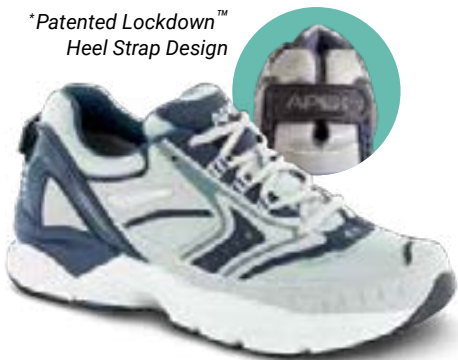
X532M* Color: Blue Sizes: 6.5-13, 14, 15 Widths: M, W, XW Depth: 5/16"