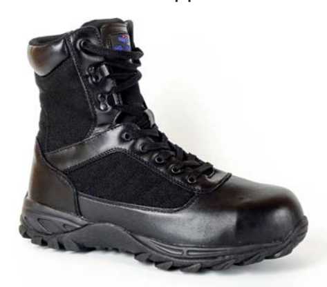
6506 Composite Toe Boots With Medial Zipper