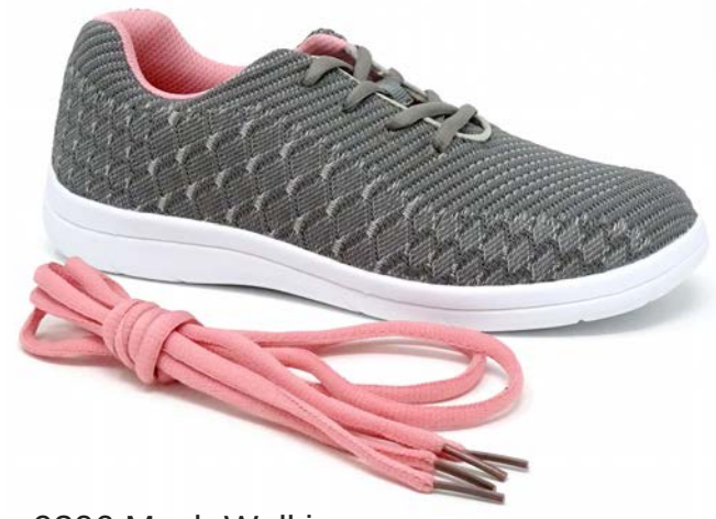
9306 Mesh Walking