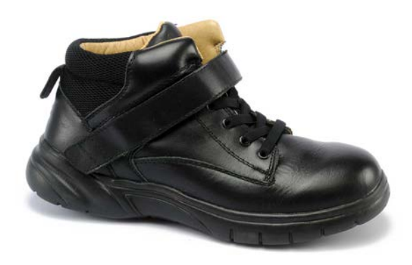
9606 Lace Black