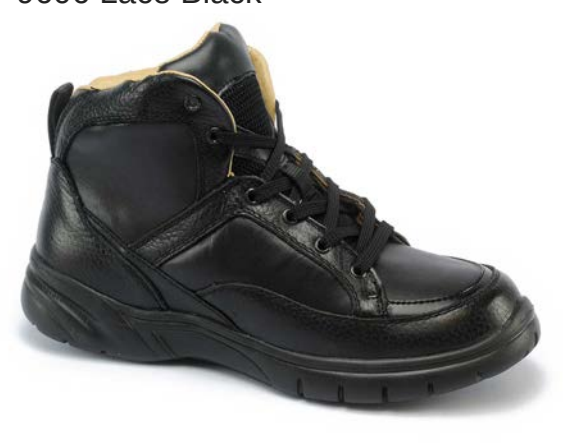
Sizes & Widths:

D/2E(M/W): 7, 7.5 - 11.5, 12-15 4E(XW): 7, 7.5 - 11.5, 12-15 6E(XXW): 7, 7.5 - 11.5, 12-15