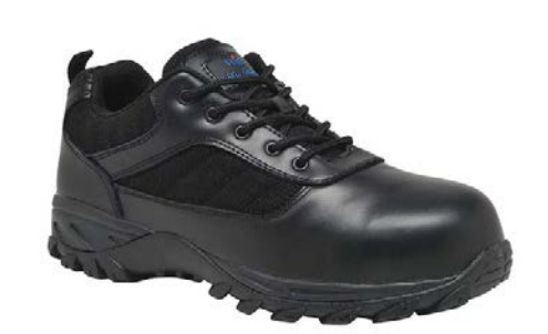
6501 Safety Shoe