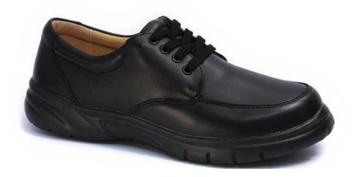
9602 Black Lycra