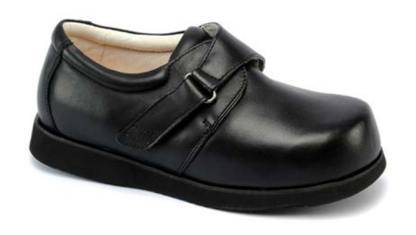
Sizes & Widths: