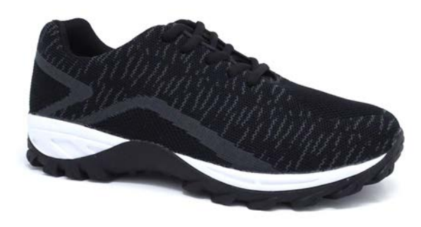
9705/9708 Breathable Walking

Widths: D, 4E, 6E, 9E Sizes: 7,7.5 - 12.5, 13 - 17