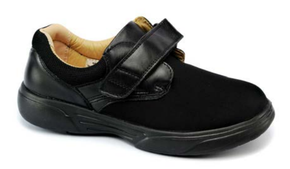
9326 Black Expandable Entrance