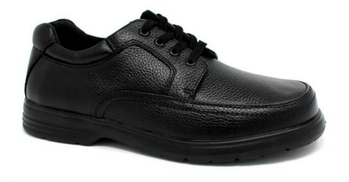
PREMIERE COLLECTION FEATURES

Genuine leather uppers with seamless lining Added width at toe & extra support at the ankle Added depth - 8mm or 5/16" deeper than conventional last Better accommodation for orthotics, AFO & internal modificatior Long medial counter to provide support & stability Removable inserts & sleeve for flexible fitting