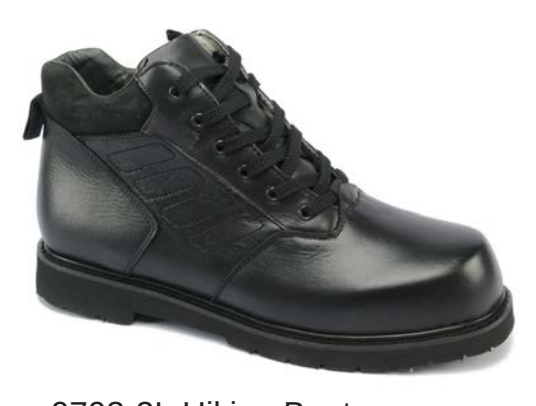
9703-2L Hiking Boots