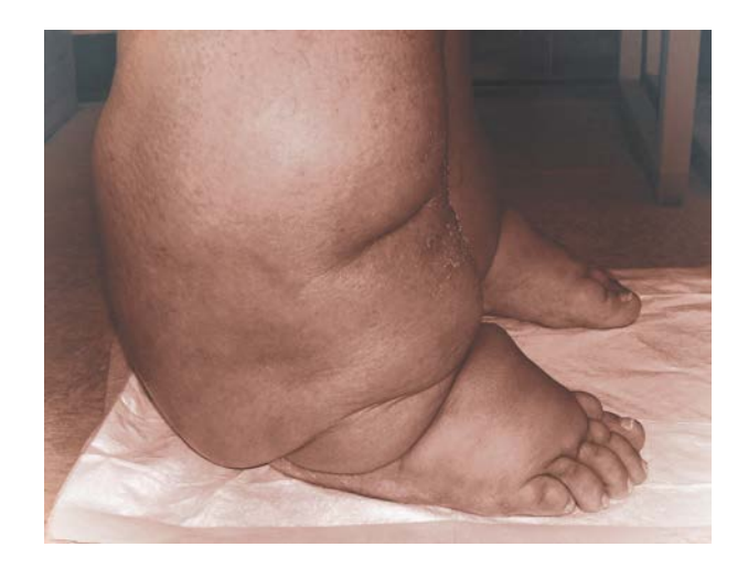
9301-X Accommodator Black