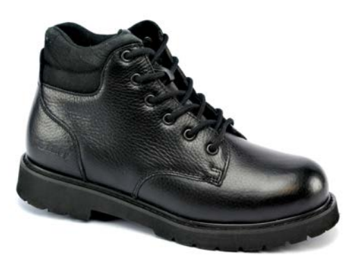
9951 6" Boots Black