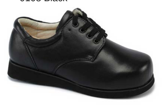
COMFORT COLLECTION FEATURES