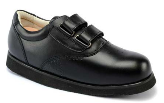
9301-C Charcot Last Black

Size: 5 - 10.5, 11- 15 Width: B, D, 3E, 5E, 7E