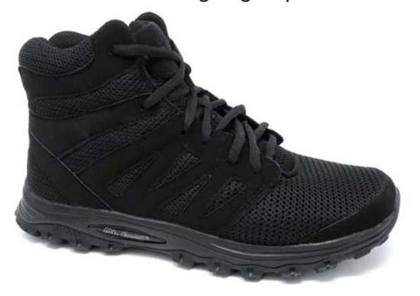
COMFORT COLLECTION FEATURES

Added / Double depth Combination last Removable inserts Extended firm heel counter HD EVA outsole for easy modification Great for AFOs and braces